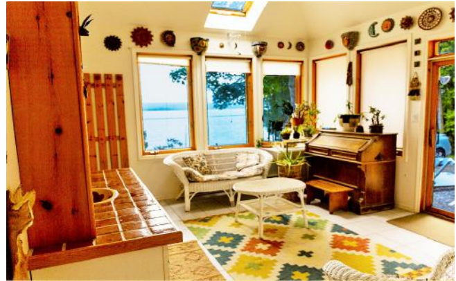
Solarium Music Room with Austrian Hopferweiser Church Organ