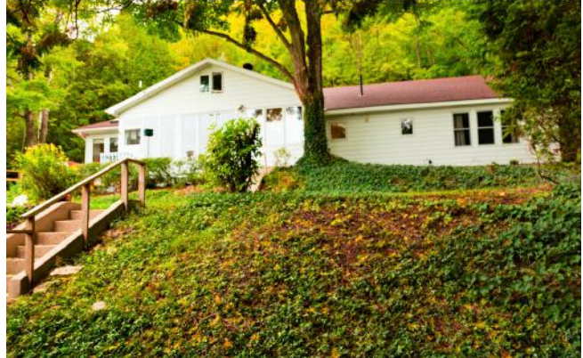
Views of the House from the Front