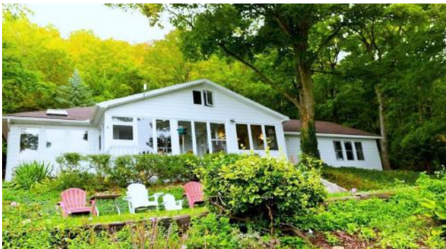
Views of the House from the Front