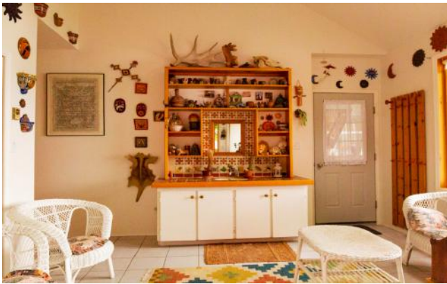
Solarium Music Room