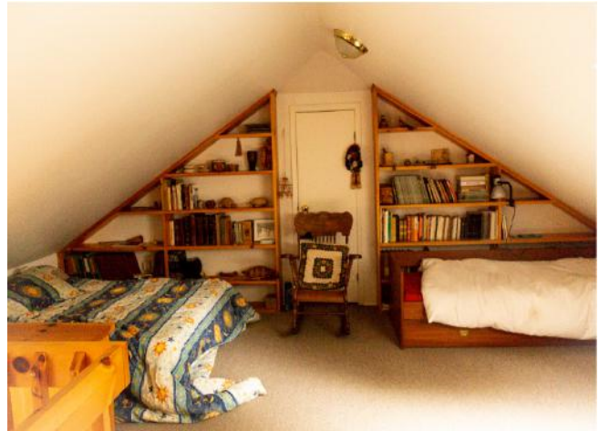
Loft Open Area – 1 Full/Double Size Bed, 1 Twin Captain Bed, 1 Full/Double Size Fold Out Futton; Adjacent Loft Bedroom 4 – Full/Double Size Bed