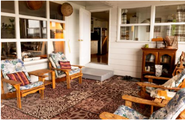
Enclosed Front Porch