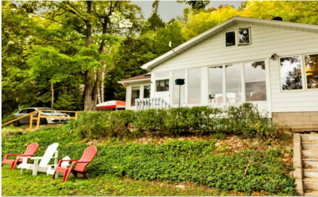
Views of the House from the Front

website: www.provizona.com/colpoys email: colpoys@provizona.com tele: 1 416 671 0223