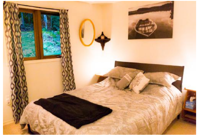
Bedroom 2 – Queen Sized Bed