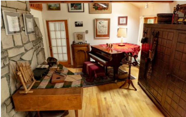
Main Music Room with Baldwin Grand Piano and Harpsichord

website: www.provizona.com/colpoys email: colpoys@provizona.com tele: 1 416 671 0223