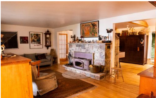
Living Room Fireplace Area