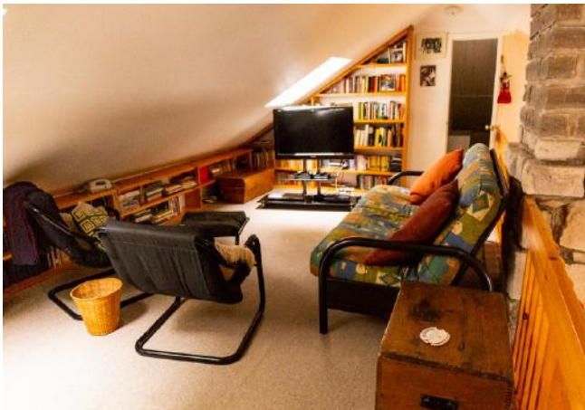
Loft Electronic Media Room Area