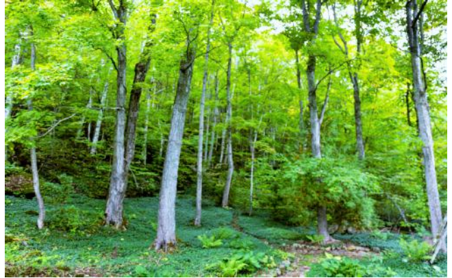
Back of the House Escarpment Trail View