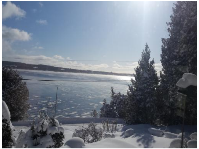
Front View from the House in Winter