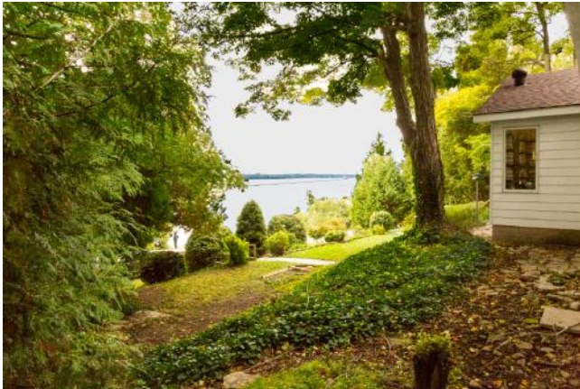
North Side View of the House