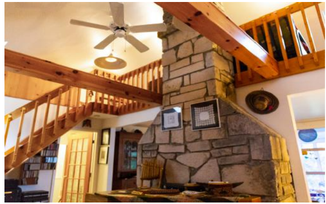
Stairs to Loft