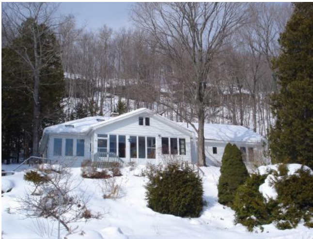
Front View of the House in Winter