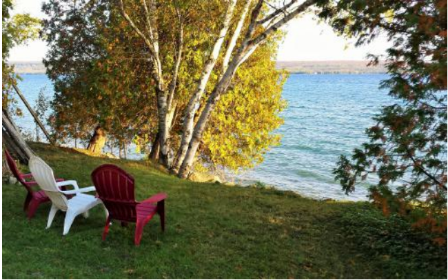
Front Waterfront View from the Shoreline

website: www.provizona.com/colpoys email: colpoys@provizona.com tele: 1 416 671 0223