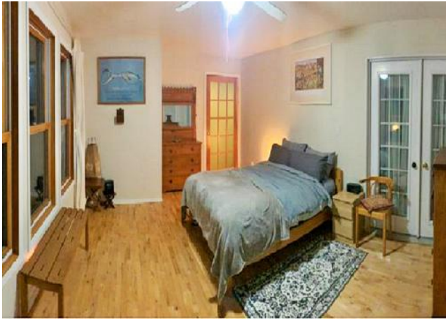
Bedroom 1 – Full/Double Sized Bed

website: www.provizona.com/colpoys email: colpoys@provizona.com tele: 1 416 671 0223