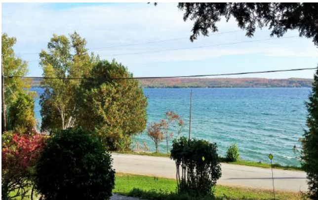
Front Shoreline View from the House