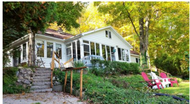
Views of the House from the Front