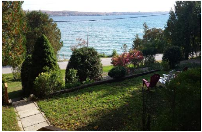
Front Shoreline View from the House