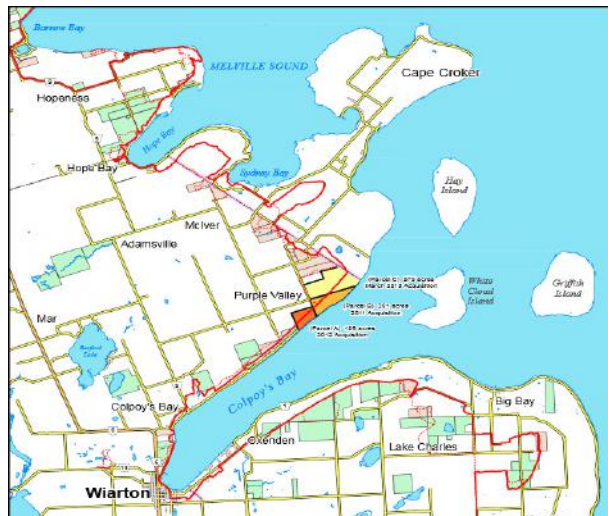
Map of Bruce Trail Adjacent to the Property