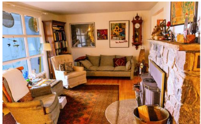
Living Room Fireplace Area Closeup