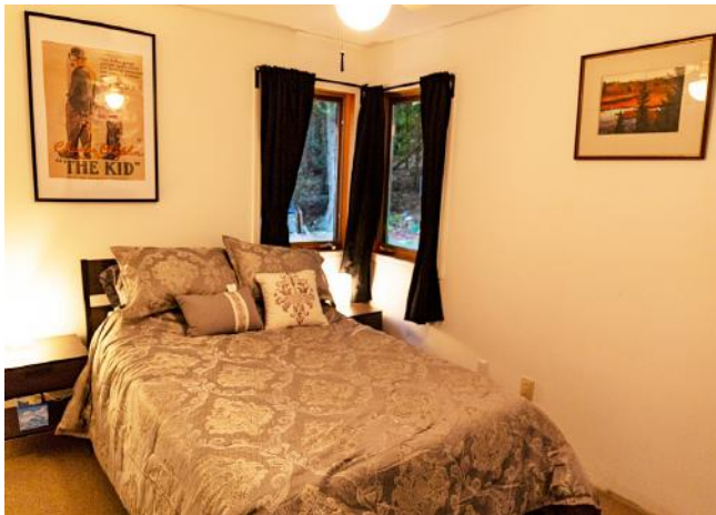
Bedroom 3 – Full/Double Size Bed